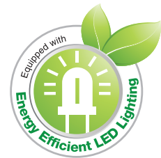
Energy Saving LED Lighting Enhances product presentation promoting more sales. No bulb servicing for 5 years. Energy efficient and eco-friendly.