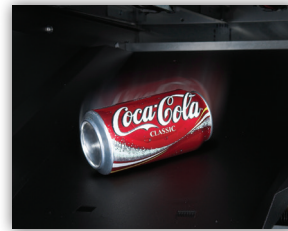
Guaranteed Delivery Sensor System

Keeps customers satisfied and reduces service calls for misloaded product.