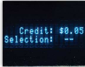
Vacuum Fluorescent Display With point of sale message and credit display options.