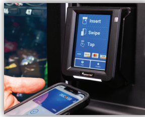
Credit/Debit & mobile reader options.