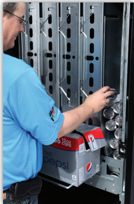
Easy Loading Product Stacks Double deep for high capacity. Built-in case support rack helps speed loading.