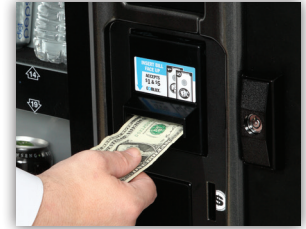
Premium Currency Acceptors Includes standard electronic coin acceptor and $1, $5, $10 & $20 bill acceptor (Set for $1 & $5)