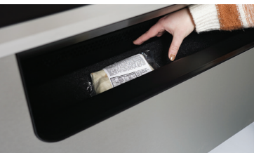
Sell Salads, Sandwiches and more!