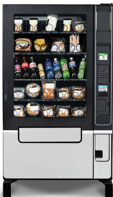
Shown with standard 3.5" Display, Braille Identified Keypad and Leg Covers