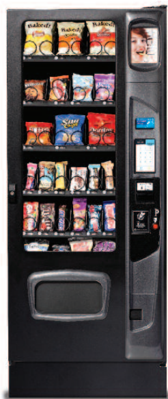
Shown with iCart touch screen & kick panel options.