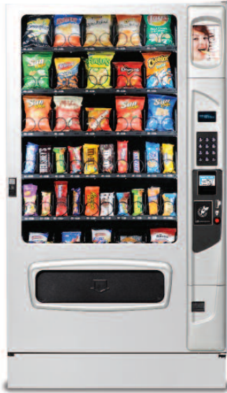
M5000 Shown with Platinum door color & kick panel options.