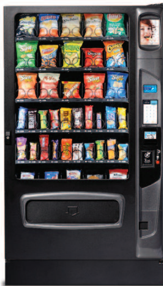
M5000 Shown with iCart touch screen & kick panel options.